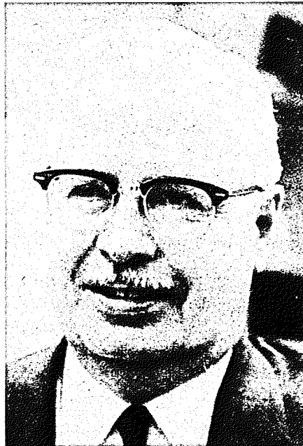
Re-elect Mayor William Cagle A Man of Integrity.