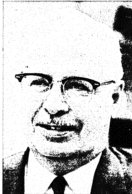
Re-elect Mayor William Cagle A Man of Integrity.